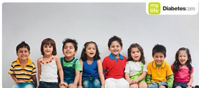
Diabetes & Resilience Chandigarh Press Club, Chandigarh INDIA