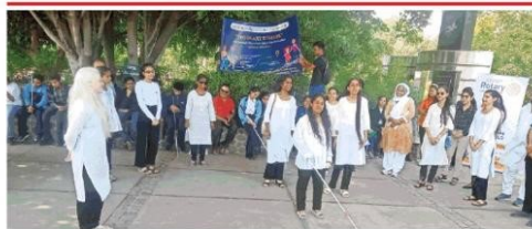
व्हाइट केन डे पर दृष्टिहीनों को परिवार और समाज में स्थिति को पेश करते हुए नुककड नाटक का मंचन करते विद्यार्थी ● अजोइन को उच्च शिक्षा के लिए घर से बाहर सामान्य बच्चों से भी बेतार हो। इसी में दृष्टिहीनों को नाकुरअंजक किया जाई। जल्द से जल्द अपने बचपने से नुककड नाटक का मंचन करना शुरू करें।

● राकू गाड़न से शुरू हुई वाकथान सुरुना लेक पर हुई रांगण ● नुककड नाटक से दृष्टिहीन विद्यार्थियों ने दिखाया समाज का दृष्टिकोण ● इंस्टीट्यूट फर द ब्लाइंड ने रोटी व सेक्टर क्लब से कराम अजोइन