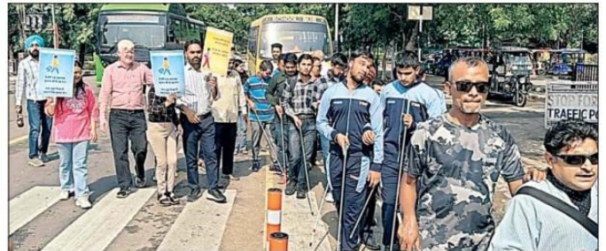
रोटररी चंडीगढ़ शिवालिक और रोटररी क्वॉटिफ एंबिलिटी क्लब ने रविवार को वॉकथन कर व्हाइट केन सेफ्टी डे मनाते हुए।