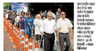
अंतरराष्ट्रीय व्हाइट केन डे पर राकू गाड़न से सुरुना लेक के लिए शिवालिक वाकथान में शामिल विद्यार्थी अजोइन अजोइन इंस्टीट्यूट फर द व्हाइट सेफ्टी डे के तहत चंडीगढ़ शिवालिक में संयुक्त रूप से कराई।