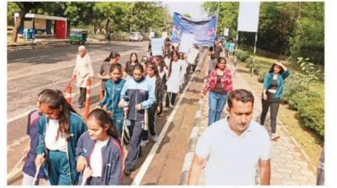
चंडीगढ़ रोटी चंडीगढ़ शिवालिक और सेक्टर-26 के प्राथमिक विद्यालय में संयुक्त रूप से कराई। अंतरराष्ट्रीय व्हाइट केन सेफ्टी डे पर राकू गाड़न से सुरुना लेक पर आयोजित इस वाकथान में अंतरराष्ट्रीय दृष्टिहीन लोगों ने भाग लिया। विद्यार्थी इंटरनैट्यूअल फर द व्हाइट सेफ्टी डे के तहत चंडीगढ़ शिवालिक, सेक्टर-26 के प्राथमिक विद्यालय में संयुक्त रूप से कराई। अंतरराष्ट्रीय व्हाइट केन सेफ्टी डे के तहत चंडीगढ़ शिवालिक, सेक्टर-26 के प्राथमिक विद्यालय में संयुक्त रूप से कराई।